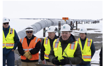
Photo: Lee Zeldin talking at the Trans-Alaska pipeline

EPA has a new generative artificial intelligence tool. And it believes climate change is dangerous. “Climate change is real and is supported by a vast body of scientific evidence,” it states in one answer. “It refers to significant and lasting changes in the Earth’s climate, particularly an increase in global temperatures, largely due to human activities such as burning fossil fuels, deforestation and industrial processes.” Read more