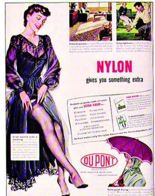
DuPont advertisement. Used with permission

When oil drillers find ethane, it is generally mixed with other gasses, including methane, used to heat our homes. Until recently, these gasses were flared off because there was no easy way to transport them to a facility where they could be recovered.